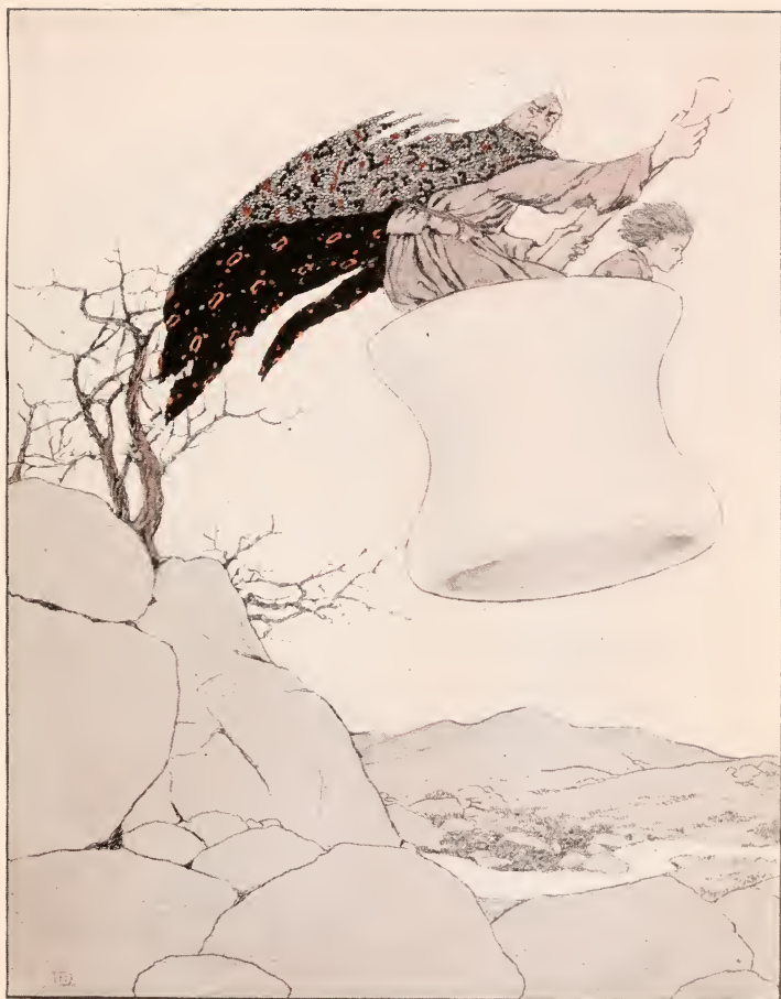
Like a whirlwind she rushed away with him. Page 113